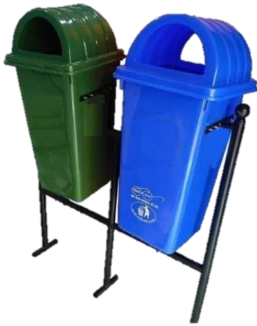
Pole Mounted Plastic Twin Bin