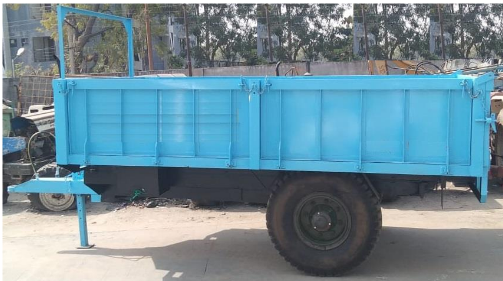
Tractor Mounted Hydraulic Trolley