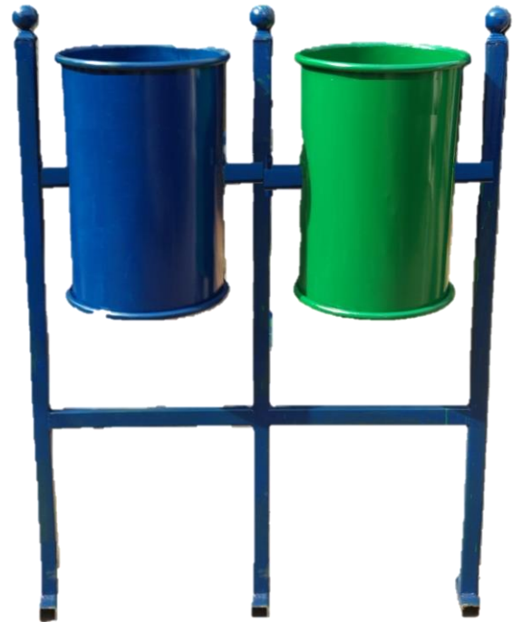
Pole Mounted Metal Twin Bin