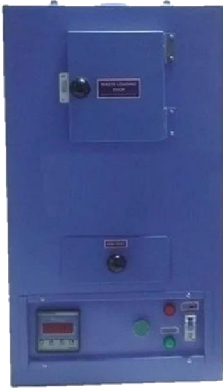
Sanitary Napkin Incinerator