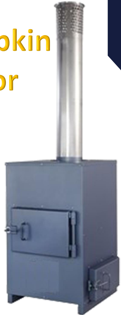
Bio-Medical Waste Incinerator